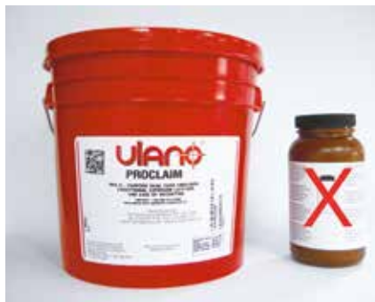
Proclaim EC utilises Ulano’s proprietary RD sensitising technology

Ulano Corporation NY, Brooklyn, New York, USA tel: +1 800 221 0616/+1 718-237-4700 email: ulano@ulano.com web: www.ulano.com