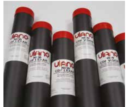
CDF Lexar and CDF Vision

When asked about future stencil technology, I reply that Ulano Research and Development will look for ways to combine anti-halation