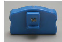
Chip resetter device