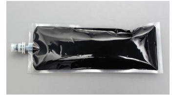
220mL Black Ink single use inner bladder tank